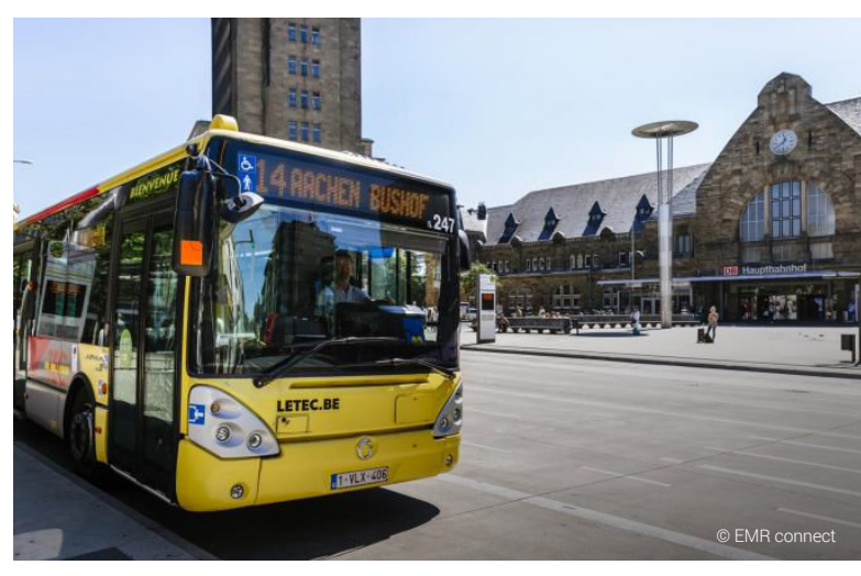
The cross border public transport in the Euregio Meuse-Rhine is managed by a collaboration of several organisations. Perfect thus for finding experts for our workshops.

Our own categorization of sectors is the following: