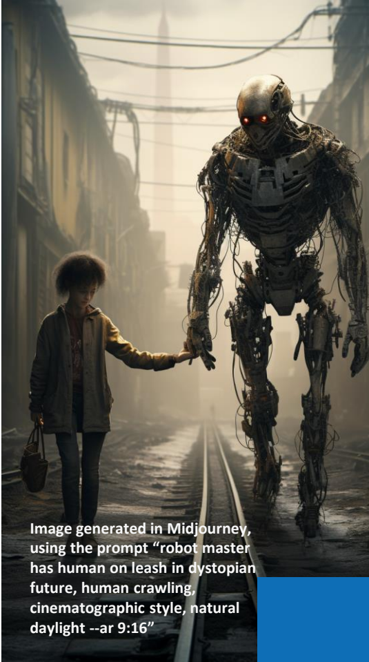
Image generated in Midjourney, using the prompt "robot master has human on leash in dystopian future, human crawling, cinematographic style, natural daylight --ar 9:16"