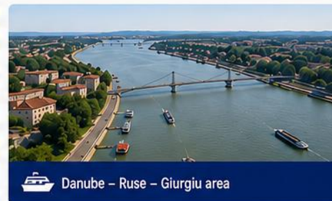
Danube – Ruse – Giurgiu area