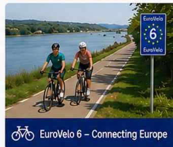
EuroVelo 6 – Connecting Europe