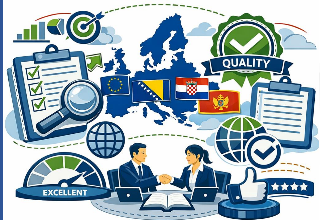
Illustration generated by AI