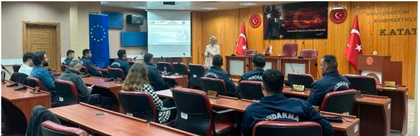
Training on effective team work in situation of crisis and migrant communication strategies”, Edirne, 25-26 April