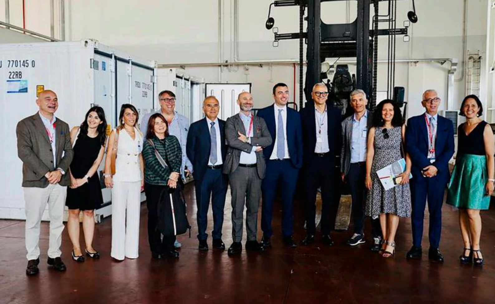
Inauguration of new hangar in Bari International Airport - Karol Wojtyla for Interreg Fresh Ways.

dependence on road transport and cutting delivery times.