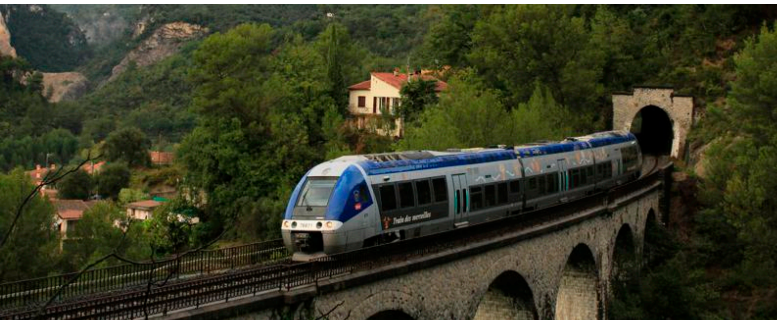
The railway line Nice-Ventimiglia-Cuneo.