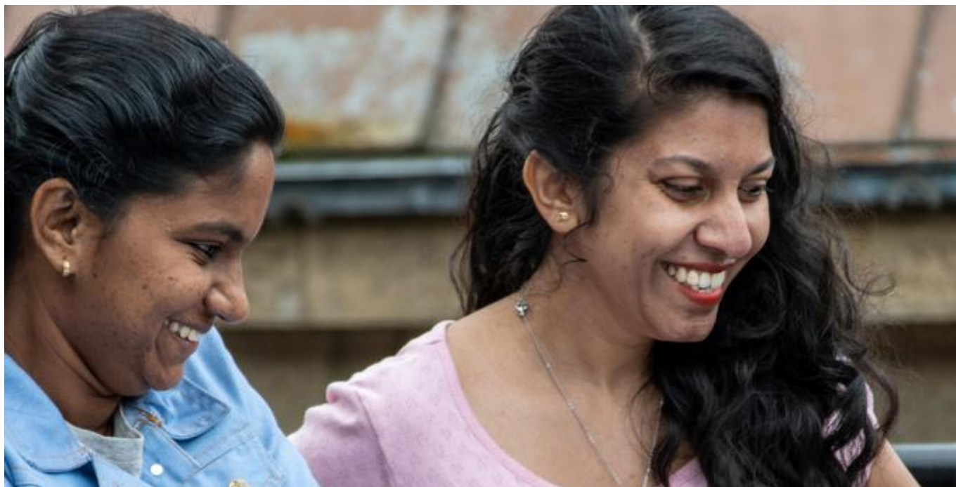
Hands-on activities and lively discussions during the mentoring workshop in Riga.