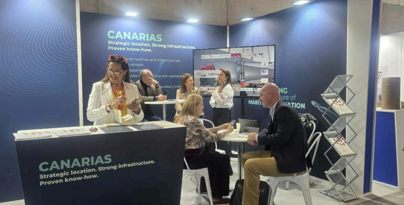
Participation of A3Matlantic SMEs in the international Nor-Shipping fair (Oslo).

noise and its effects on marine life: the proof that local know-how can have global relevance.