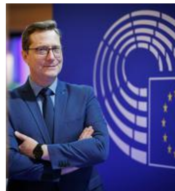
Vladimir Prebilič MEP, Greens/EFA Coordinator in REGI Committee

As we look ahead to critical budgetary decisions, the responsibility is political and clear: to champion cooperation, protect cohesion, and ensure that the European project remains a project for all - not just for a few.