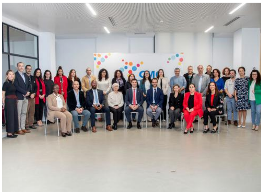
A3MAtlantic kick-off meeting (partners' group photo).