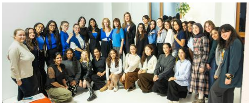
LinkedIn workshop, as part of the CeMeWE project.