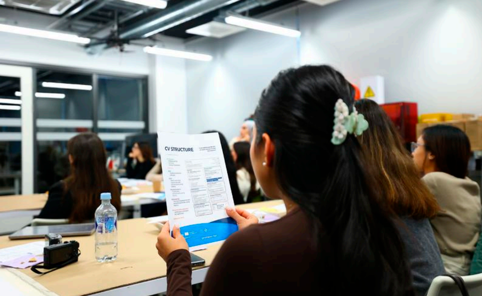
CV making workshop.

“ I learned to manage time, take responsibility, and gained confidence, communication, and social skills”